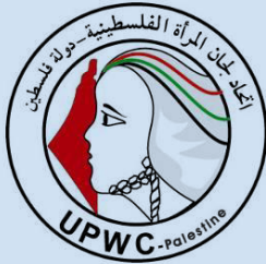
Slogan 1: Union of Palestinian Women Committee

participation was expressed enthusiastically in the slogans of their organizations (see below: slogan 1, slogan 2). It was highlighted by the Women's Affairs Assembly slogan – "Women's Participation Makes the Event" 19 – to confirm and demonstrate the need for women's participation in political decision-making process.